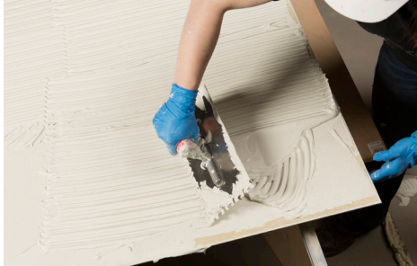
Ultra-Long Open Time

TotalFlex® 150 and 110 high-performance universal mortars combine maximum versatility with ultra-long open time and super-easy troweling. They are ideal for large heavy tile (LHT), gauged porcelain panels, thin-set applications, and uncoupling membranes. TotalFlex mortars provide new possibilities to improve tile installation efficiency, quality, and speed – all while enhancing safety with a reduced weight, silica-free* formula.